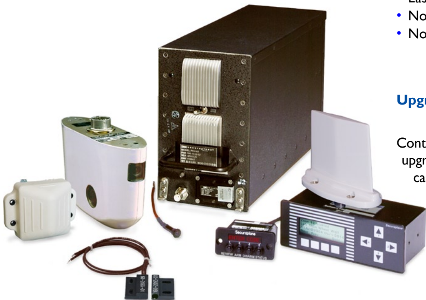
Shown with optional CAM-14 quad video camera unit

Contact Securaplane to find out how simple it can be to upgrade your current security system to PreFlite. In most cases, PreFlite installs using the existing security system installation provisions with minimum effort.